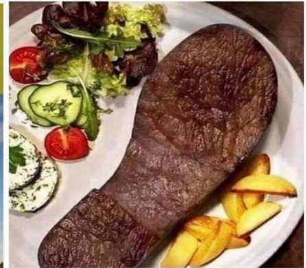
When you order your steak well-done