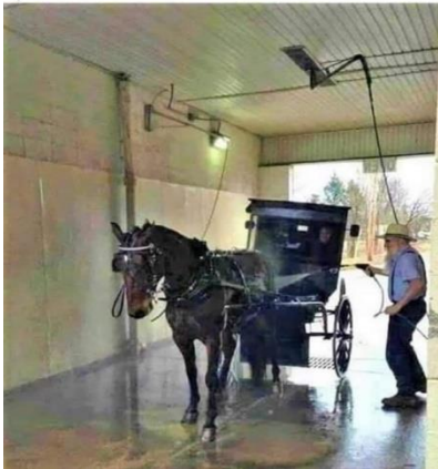
Amish farmer washing his classic Mustang.

TODAY'S HOUSEKEEPING TIP: "Always keep several get well cards on the mantel. That way, if unexpected guests arrive, they'll think you've been sick and unable to clean."